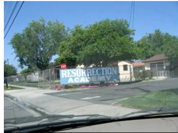
Resurrection Academy in Fontana