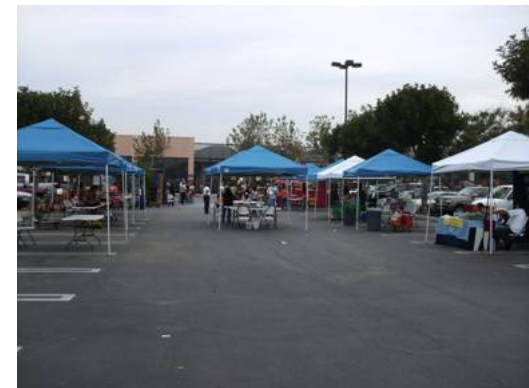
Safety Day at Home Depot in Chino