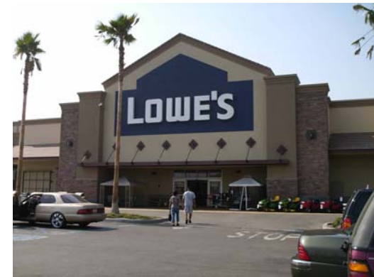
Lowe's in Ontario