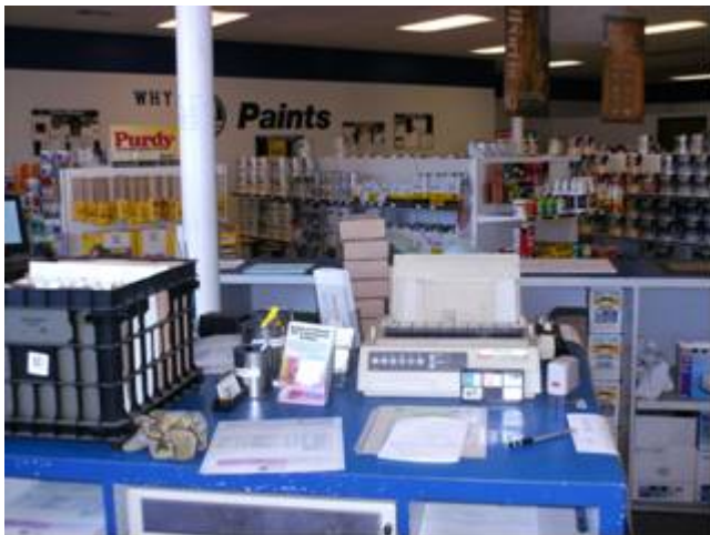
ICI Paints in San Bernardino