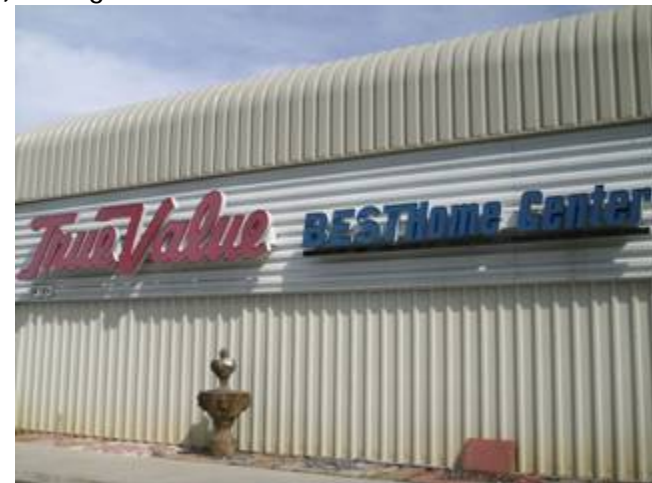
True Value Hardware Best Home Center in Yucaipa