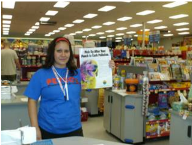
PETCO in Montclair