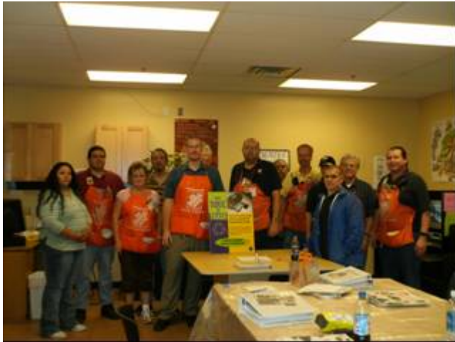
Photo 6.0 Home Improvement Store Presentations