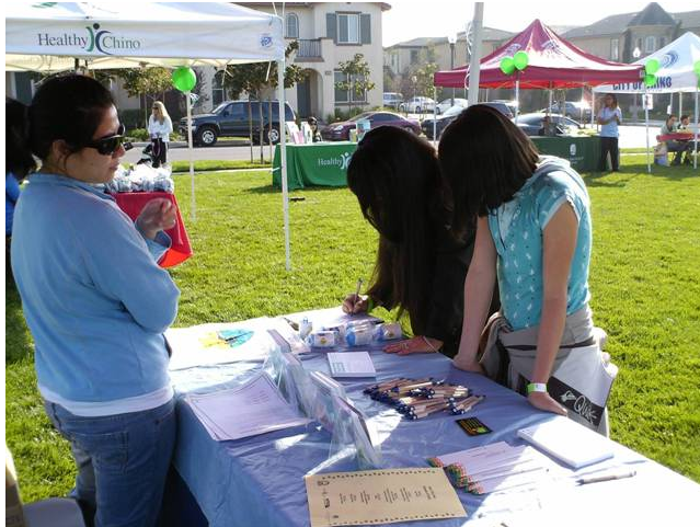
Bark in the Park Event in Chino