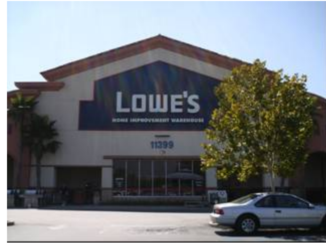
Lowe's in Rancho Cucamonga