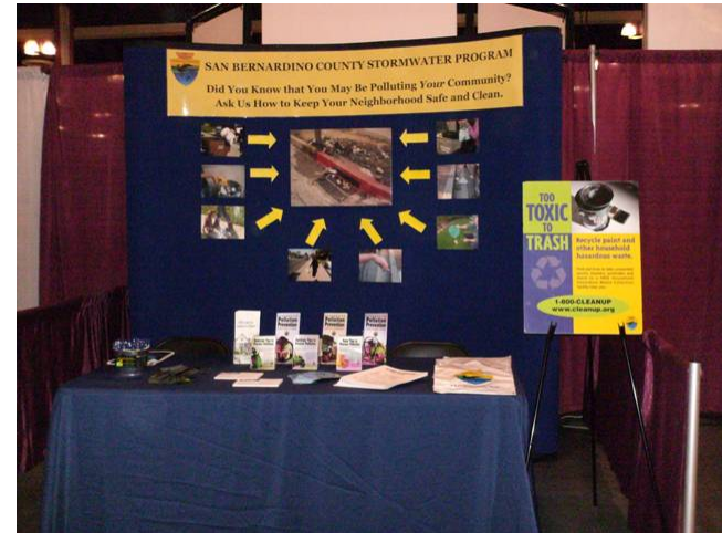
Inland Empire Home Remodeling and Design Show