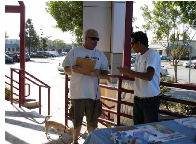
PetCo in Montclair