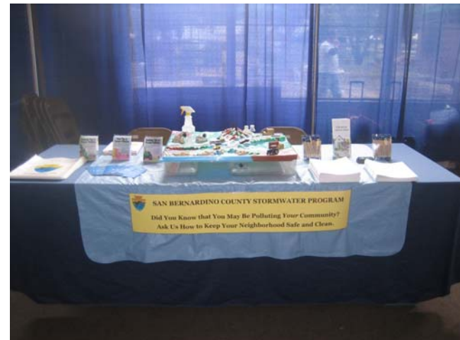
National Orange Show Festival