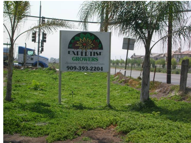
Expertise Growers in Ontario