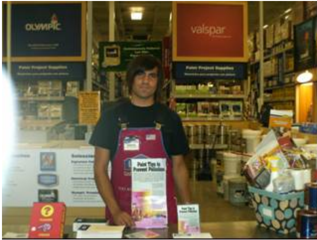
Photo 4.0 Home Improvement Store Outreach