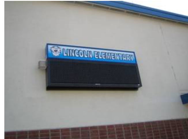
Lincoln Abraham Elementary School in Colton