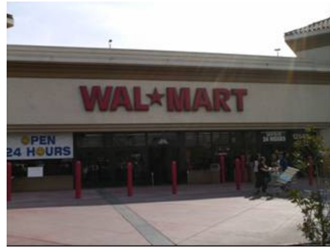
Wal-Mart in Rancho Cucamonga