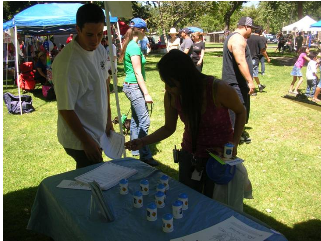
HOPE Pet Adoption Faire in Upland