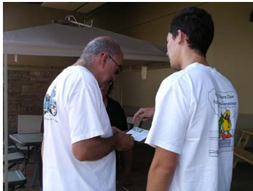
Photo 5.0 Home Improvement Store Tablings