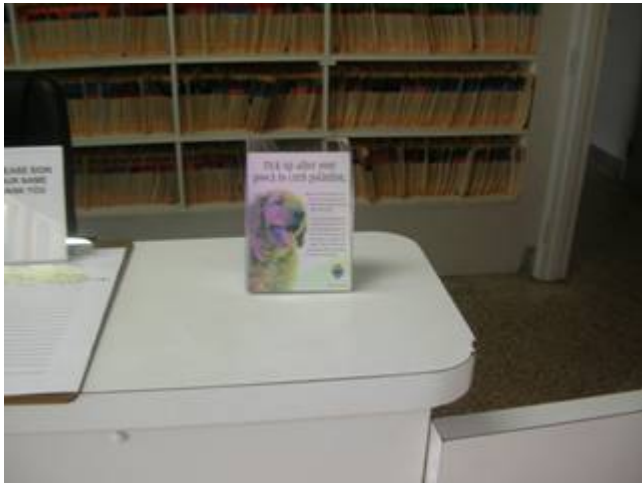
General Cat & Dog Hospital in San Bernardino