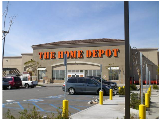
Home Depot in Fontana