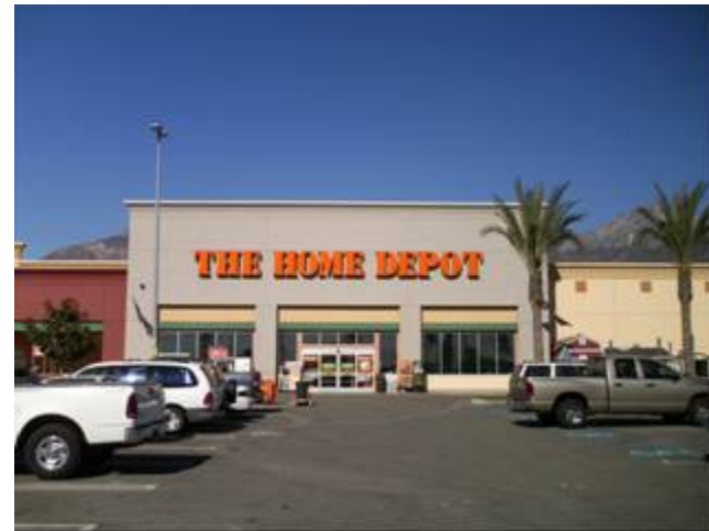
Home Depot in Upland