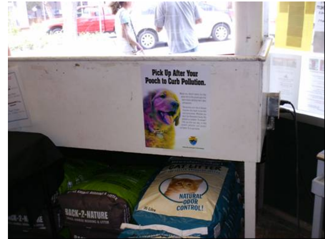
Upland Feed and Fuel in Upland