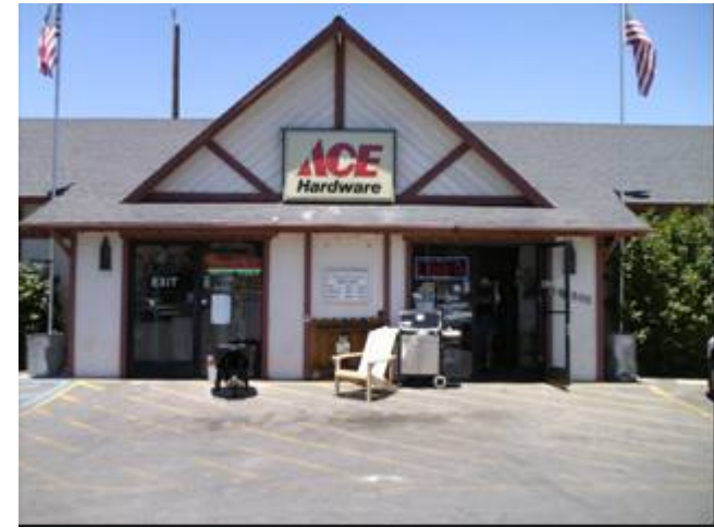
Riffenburgh Lumber (ACE) in Big Bear