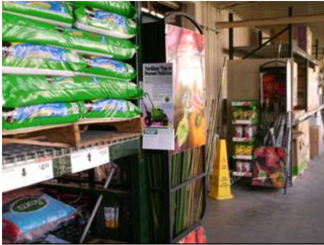
Photo 1.0 Garden Centers/Nurseries Outreach